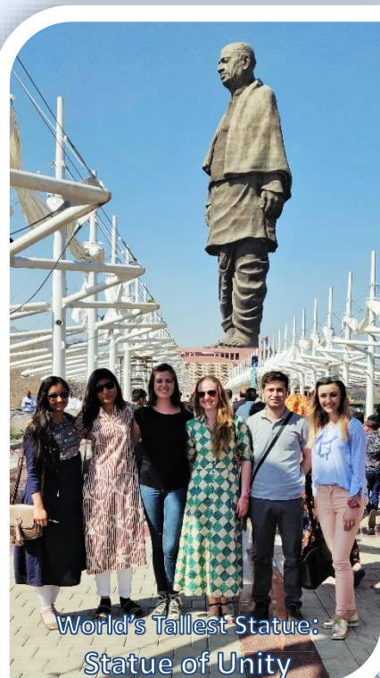
World's Tallest Statue: Statue of Unity

At Winter School Program for management studies, International students study about the business opportunities in the Small and Medium Enterprises (SMEs) through class sessions with industry interactions and experience the flavor of Indian festivals with lots of exciting trips and tours to the heritage and cultural sites in the state of Gujarat.